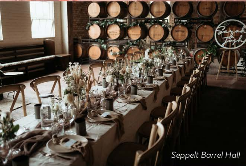
Seppelt Barrel Hall